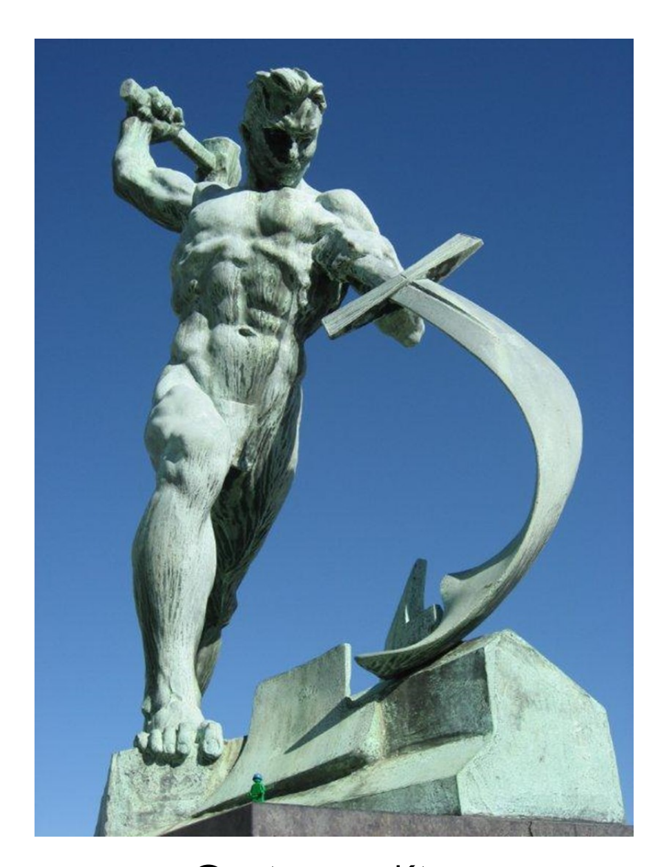
CHRIST THE KING A SERVICE OF THE WORD AND SACRAMENT NOVEMBER 20, 2022 10:30AM