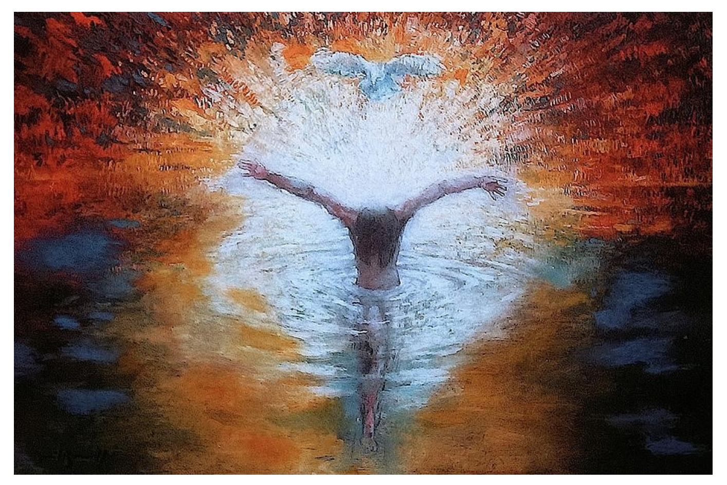
The Baptism of Christ with Dove Daniel Bonnell (American)

A CONGREGATION OF THE PRESBYTERIAN CHURCH (USA)