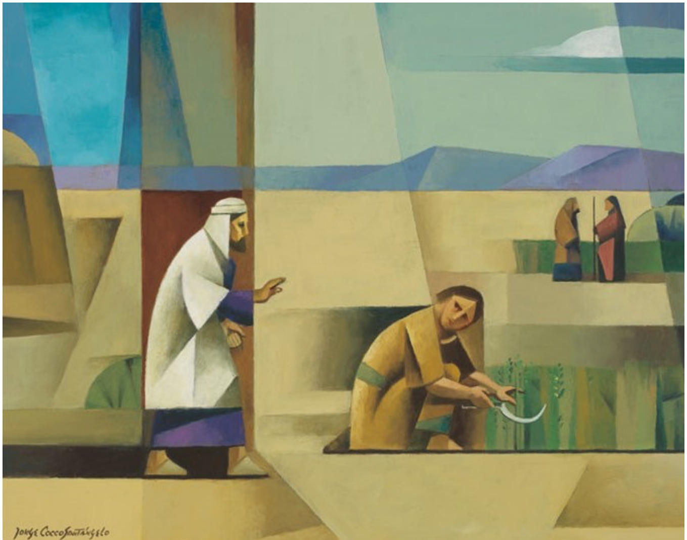
Wheat and Tares, Jorge Coco

A CONGREGATION OF THE PRESBYTERIAN CHURCH (USA)