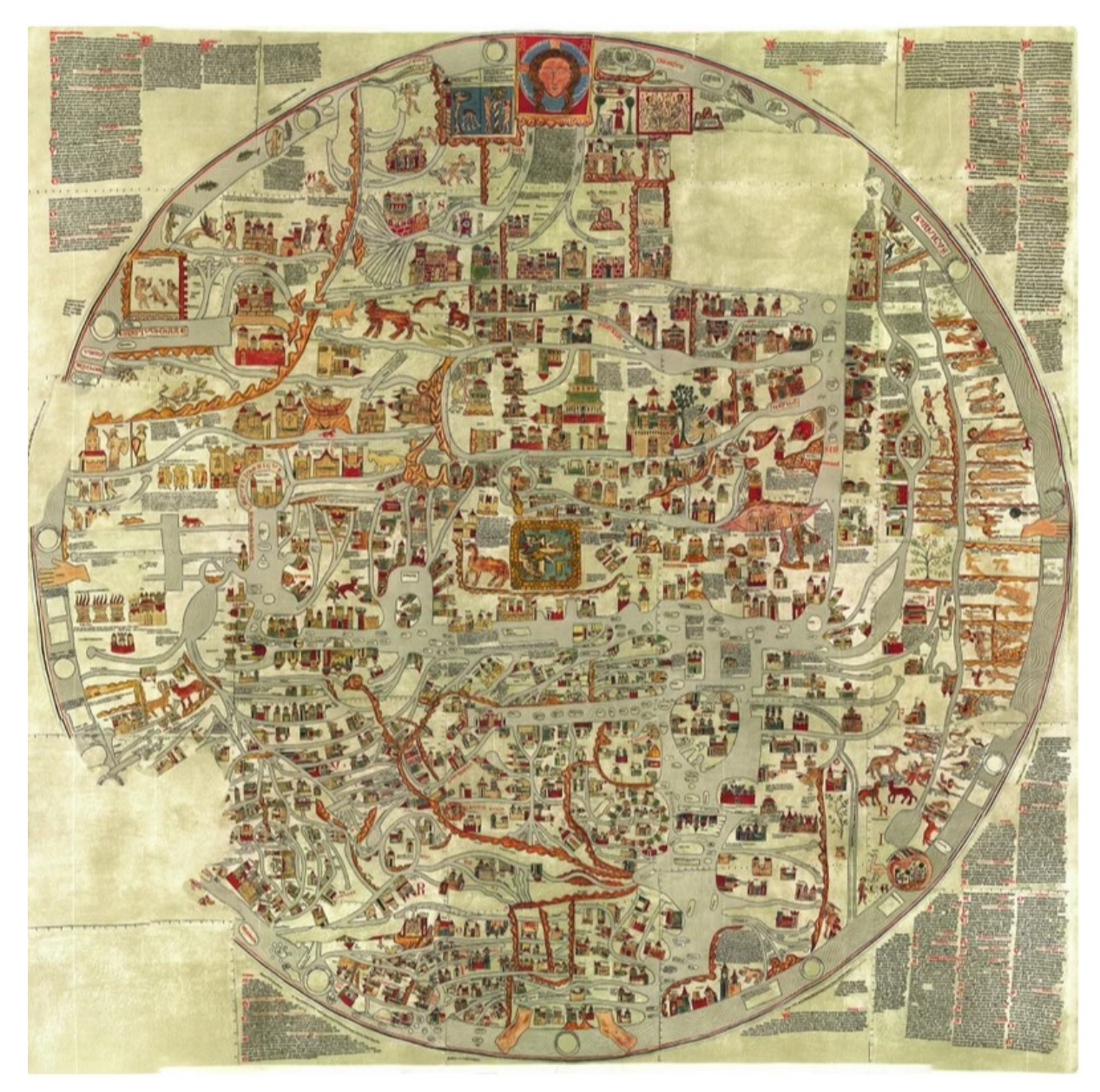
Ebstorfer Mappa Mundi, 13th Century German

A CONGREGATION OF THE PRESBYTERIAN CHURCH (USA)