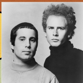
SIMON AND GARFUNKEL