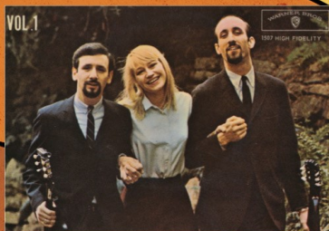
PETER, PAUL, & MARY