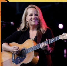
MARY CHAPIN CARPENTER