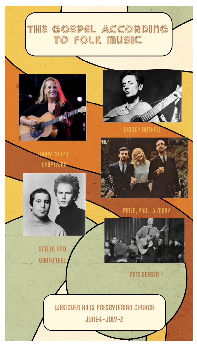
TRINITY SUNDAY A SERVICE OF WORD AND SACRAMENT JUNE 4, 2023 10:30AM

A CONGREGATION OF THE PRESBYTERIAN CHURCH (USA)