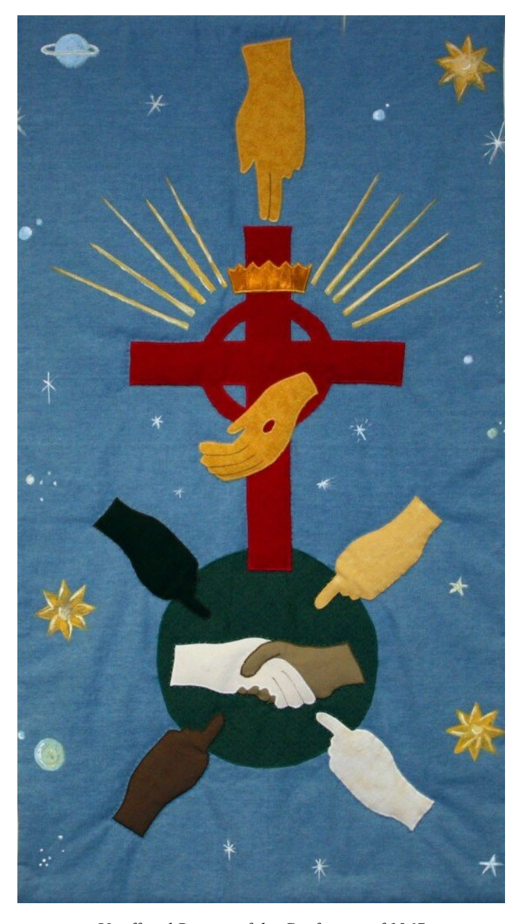
Unofficial Banner of the Confession of 1967

A CONGREGATION OF THE PRESBYTERIAN CHURCH (USA)